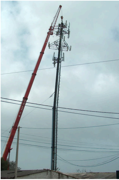
Fig. 1. Collapse of a 40-metre-high monopole