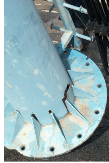
Fig. 2. Detail of the rupture at mid-height

On August 29, 2005, Hurricane Katrina struck the United States Gulf Coast and caused catastrophic damage to the combined telecommunications and power infrastructure. Devastating effects on both infrastructures hampered rescue efforts, blocked attempts to coordinate early responses, and made calls for aid impossible from the hardest-hit areas [28], [29]. White House Katrina Report described the results: “The complete devastation of the communications infrastructure left responders without a reliable network to use for coordinating emergency response operations” [28]. While it is tempting to view a catastrophe such as Katrina as an once-in-a-lifetime event, doing so would be an exercise in wishful thinking. Eight months before Hurricane Katrina, on December 26, 2004, the Indian Ocean tsunami highlighted the heavy human cost of communications breakdown during extreme events. While seismic monitoring stations throughout the world detected the massive sub-sea earthquake that triggered the tsunami, a lack of procedures for communicating these warnings to governments and inadequate infrastructure in the regions at risk delayed the transmission of warnings. However, based on the successful evacuation of the handful of communities that did receive adequate warning through unofficial channels, it is clear that better communications could have saved thousands of lives.